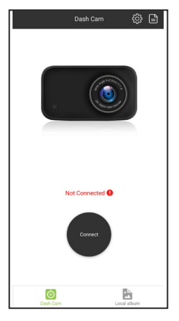
Camera is not connected